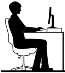
Reclined propped position for keyboarding

The above diagram shows the “elbow floating position” for keyboarding, where your elbows are beside your body but unsupported. A variation on this which can assist in reducing neck tension is the “reclined propped position” where you move the keyboard further away from you and support the forearms along the desk. You may need to slightly reduce the height of the chair for this position to ensure you stay supported in your seat.