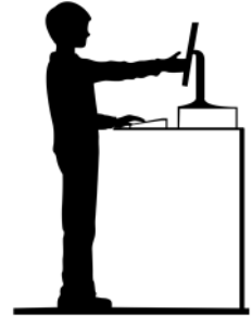
Standing work station recommended position

As with sitting, it is recommended to break this position regularly (every 45-60 mins at least) to sit down and/or stretch.